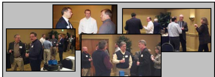
Board Members, both current and past, mingle with the crowd.

The day's events were well received and member input and feedback from the program was greatly appreciated. We look forward to seeing all of you, and new faces, at our next quarterly meeting scheduled for April 19 th in Exton, PA. Watch the website and email blasts for details and on this and other PCPG sponsored events.