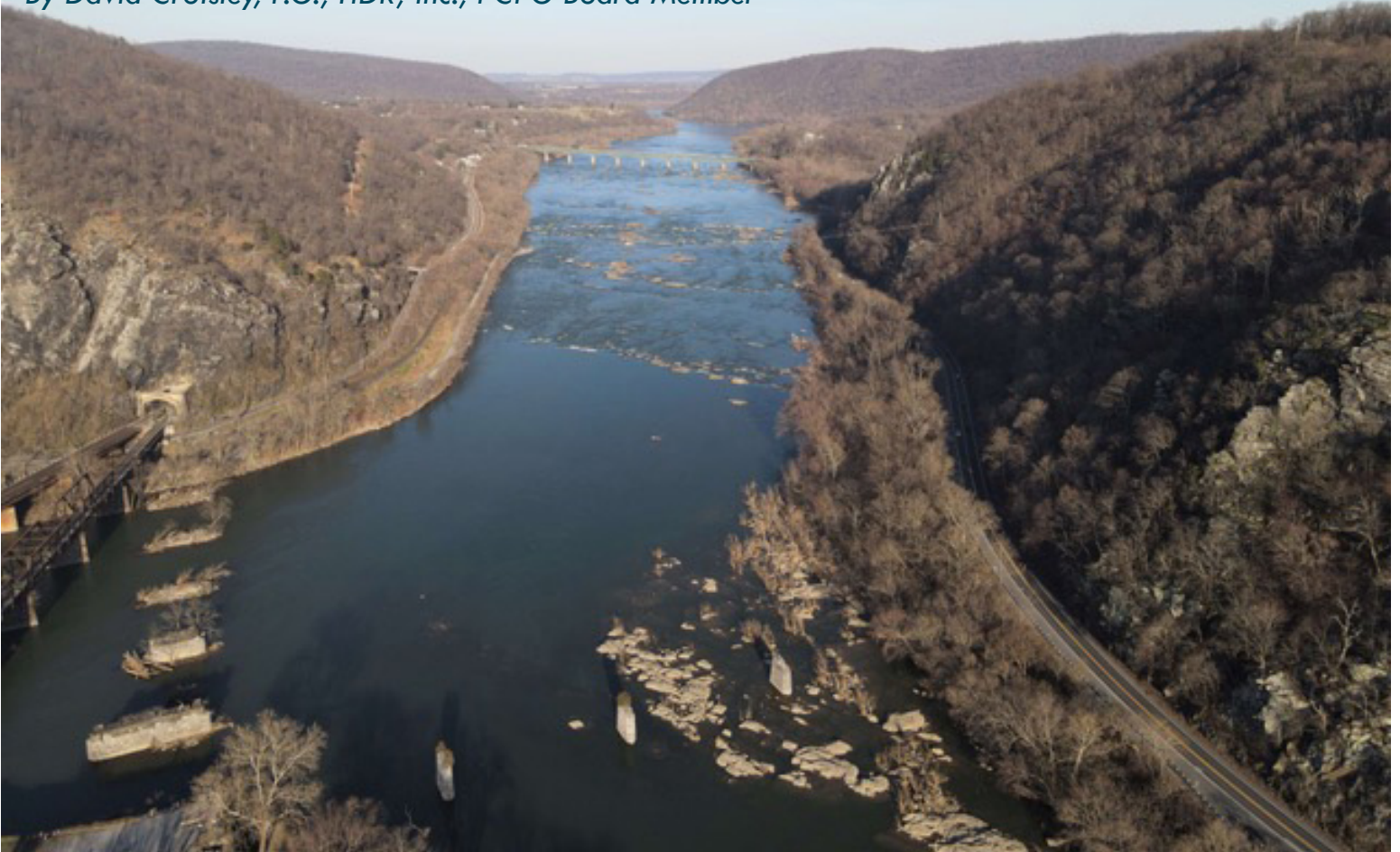
Aerial view of the US 340 Corridor in Harpers Ferry, looking east. Study area in bottom right of photo.