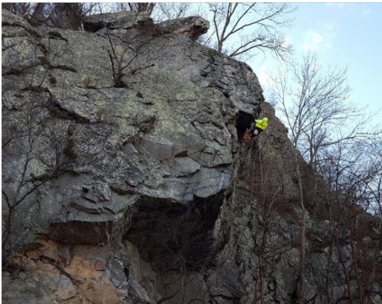
Ameritech Slope Constructors collecting field data while rappelling the rock slope.

The results of the slope evaluations required various treatments to be implemented for the project due to the highly variable geometry of the slope. On slope treatments such as attenuator barriers and roadway level treatments such as rockfall fences are recommended to mitigate the rockfall potential. With the results of the global and sub-global design analyses, as well as the geotechnical design of the slope treatments, HDR has been able to provide remediation recommendations to mitigate future potentially dangerous rockfall events. The safety for vehicular traffic in the Harper's Ferry area is of utmost concern and the recommended slope treatments have been developed to prevent future rockfall events.